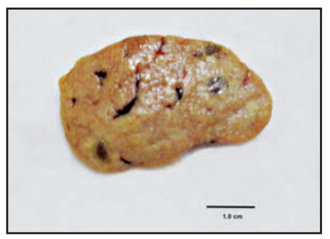
Figure 4. Diffuse yellow granulomas in markedly vascularized spleen measuring approximately 3.0 cm in length. At the cut, 90% of the tissue was replaced by granulomas adjoining with each other.

subjected during captivity or transportation, resulting in disseminated disease and widespread granulomatous nodules severely affecting organ tissues.