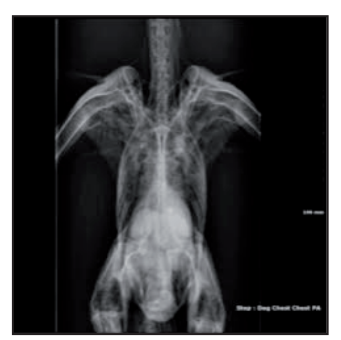
Figure 1. Coelomic radiology of Harpy eagle, anterior posterior view with multiple opacities in air sacs.