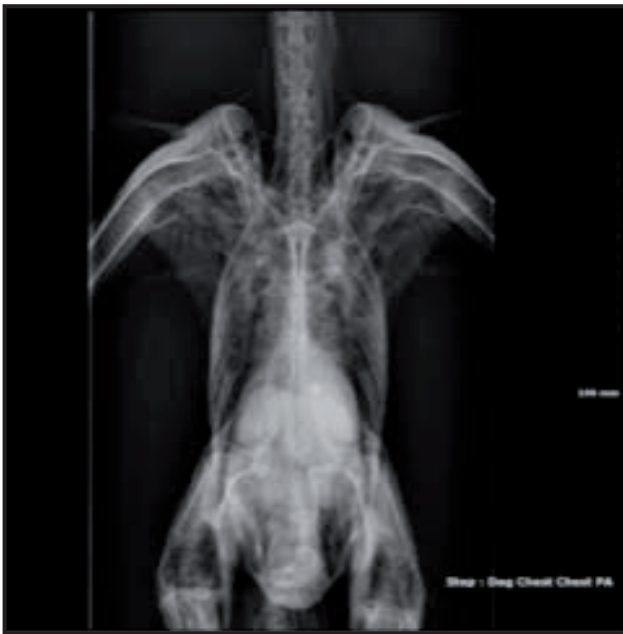
Figure 1. Coelomic radiology of Harpy eagle, anterior posterior view with multiple opacities in air sacs.