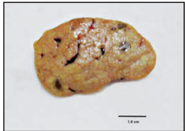
Figure 4. Diffuse yellow granulomas in markedly vascularized spleen measuring approximately 3.0 cm in length. At the cut, 90% of the tissue was replaced by granulomas adjoining with each other.

transmission, even though oral route cannot be ruled out considering the alterations in the intestine walls and the presence of Mycobacterium -like bacilli in intraluminal space. The oral route has been described as the primary mode of transmission for infected animals in contact with contaminated water and soil [21,25]. However, further studies are requiring to elucidate the characteristics and clinical signs of this disease in harpy eagles and other raptors.